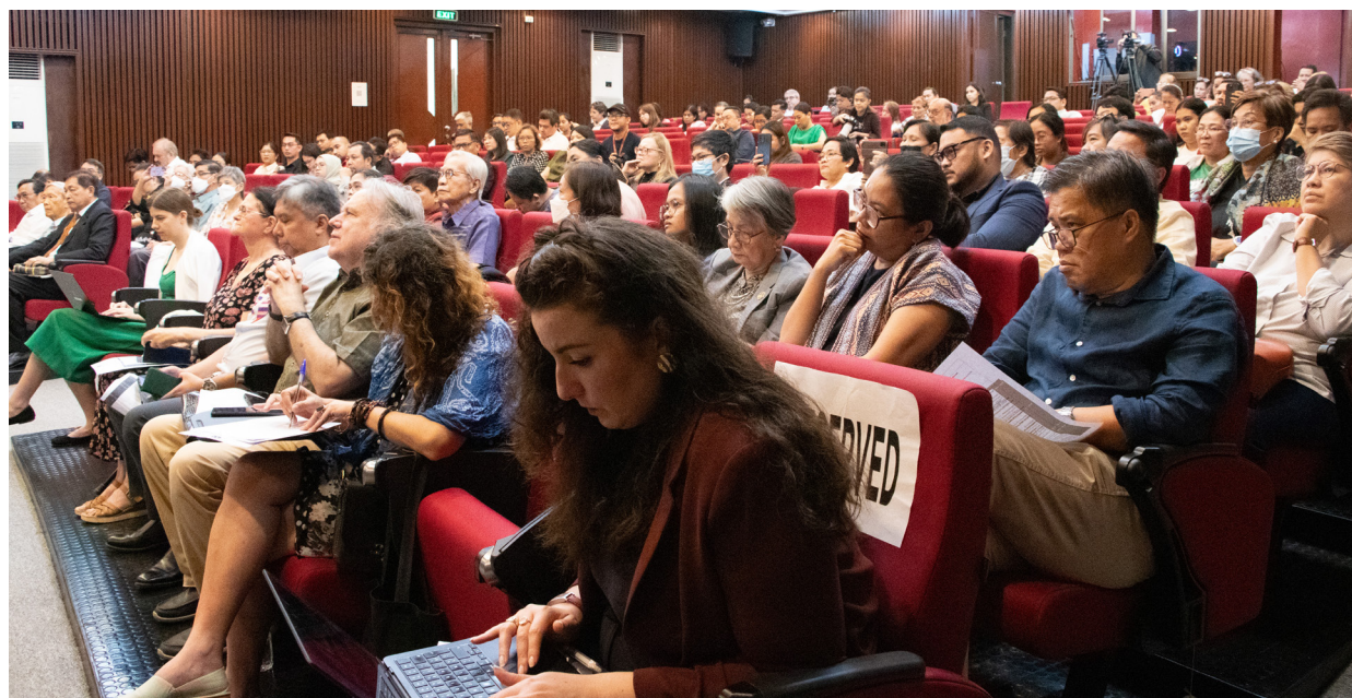
In-person attendees at the 2024 IFTD event

Attorney Cortez highlighted that the courts, knowingly or unknowingly, become instruments for the perpetuation of legal harassment. The rules of procedure provide remedies to assess the strength of evidence when the case reaches the courts, but these are frequently ignored, and courts often view the accused as merely delaying proceedings when they file complaints.