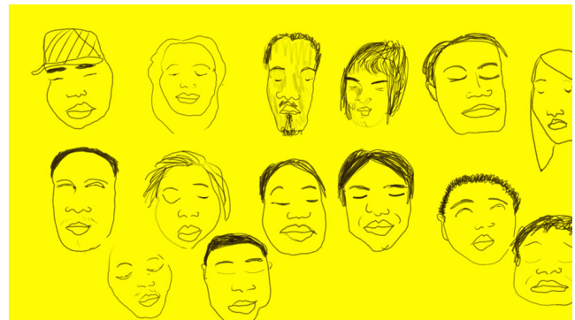
Still images from Reactive Courage: all eyes opened, all eyes closed