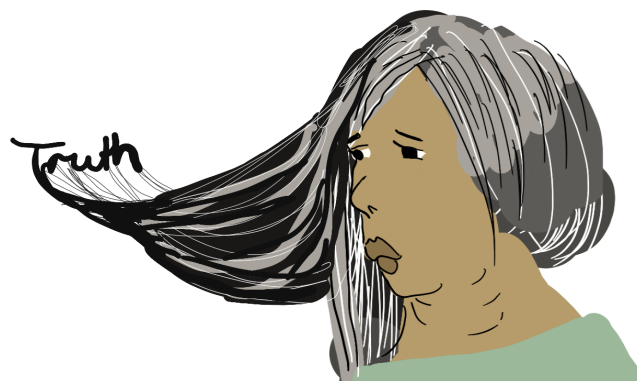
Still image from Reactive Courage: truth